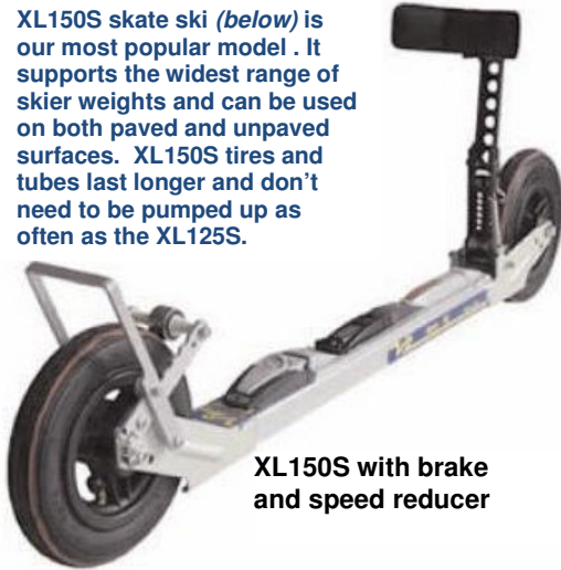
XL150S with brake and speed reducer

XL150S skate ski ( below ) is our most popular model. It supports the widest range of skier weights and can be used on both paved and unpaved surfaces. XL150S tires and tubes last longer and don't need to be pumped up as often as the XL125S.