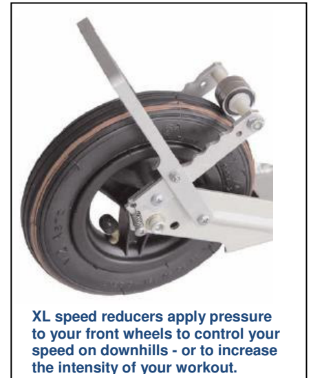
XL speed reducers apply pressure to your front wheels to control your speed on downhills - or to increase the intensity of your workout.