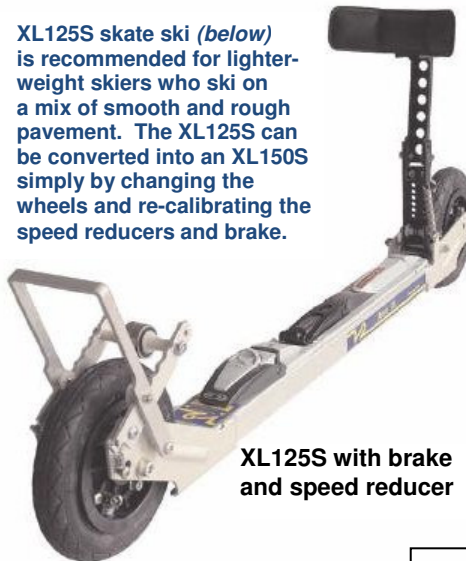
XL125S with brake and speed reducer

XL125S skate ski ( below ) is recommended for lighter-weight skiers who ski on a mix of smooth and rough pavement. The XL125S can be converted into an XL150S simply by changing the wheels and re-calibrating the speed reducers and brake.